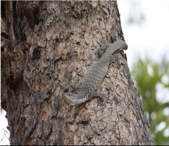
Spotted Tree Monitor ( Varanus scalaris ) (E. Evans)