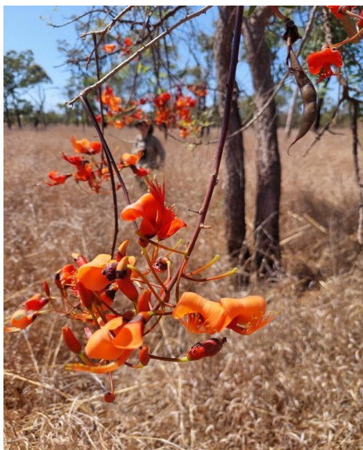
Bat Wing Coral Tree ( Erythrina vespertilio) along the road into Emu Swamp.