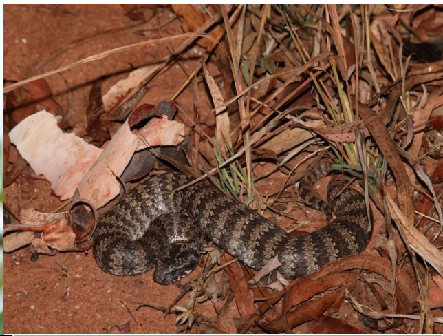
Common Death Adder ( Acanthophis antarcticus ) (E. Evans)