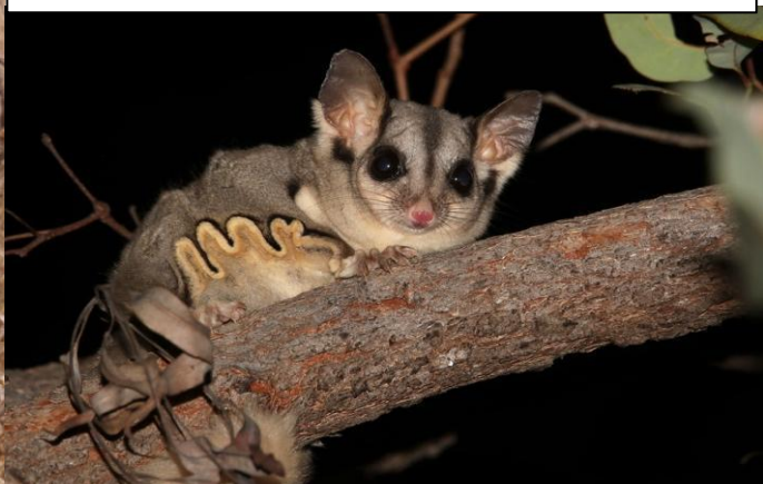
Inland Sugar glider ( Petaurus notatus ). (E. Evans)